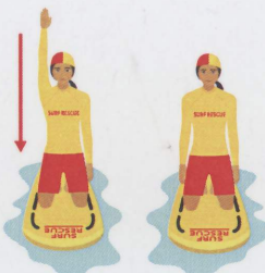
10. Shore signal received and understood