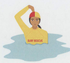
13. All clear/ok