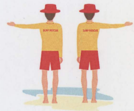
4. Go the right or to the left