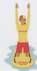
11. Emergency evacuation alarm