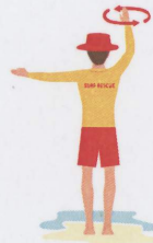
2. Pick up swimmers