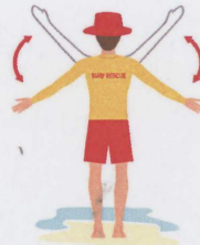
7. Pick up or adjust buoys