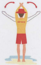
1. Attract attention