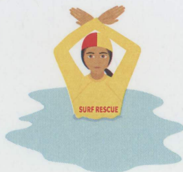
12. Submerged victim missing