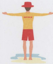
5. Remain stationary