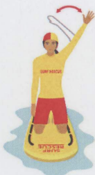
9. Assistance required